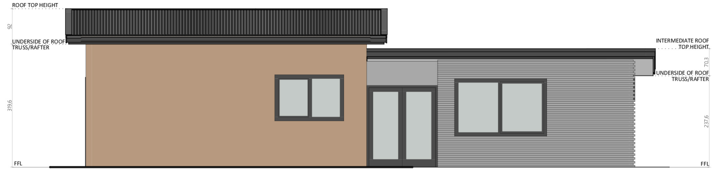
NORTH - WEST ELEVATION