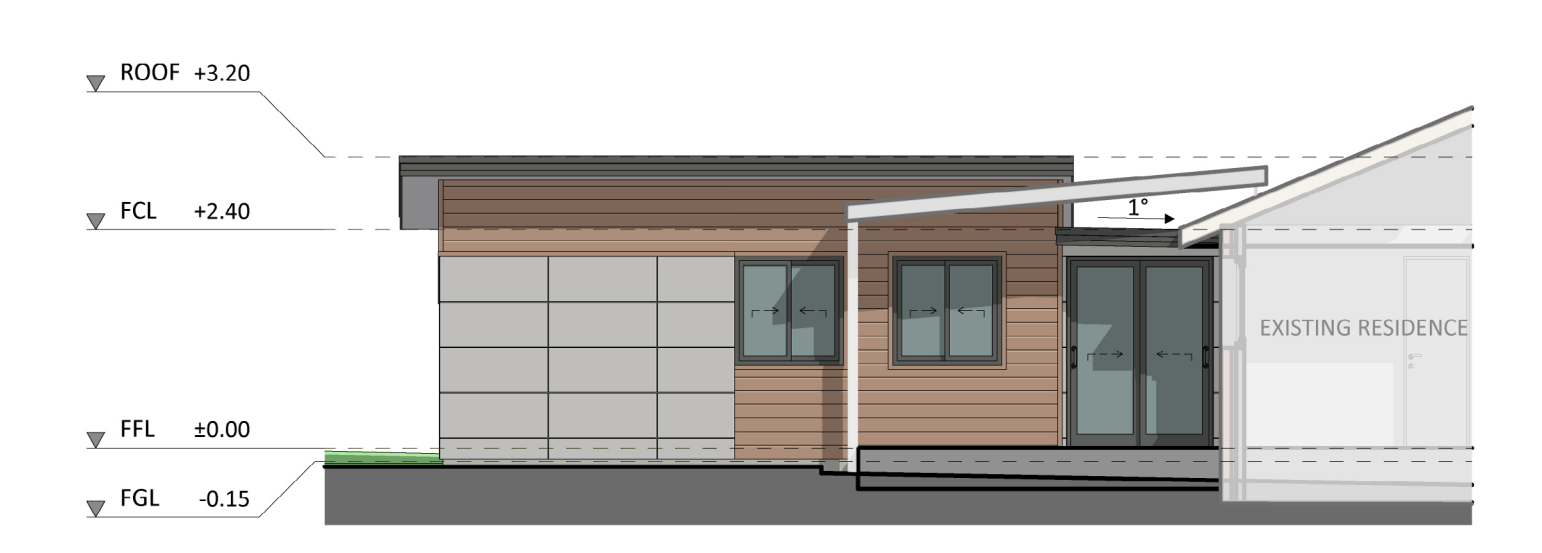
FCL +2.40 FFL ±0.00 FGL -0.15