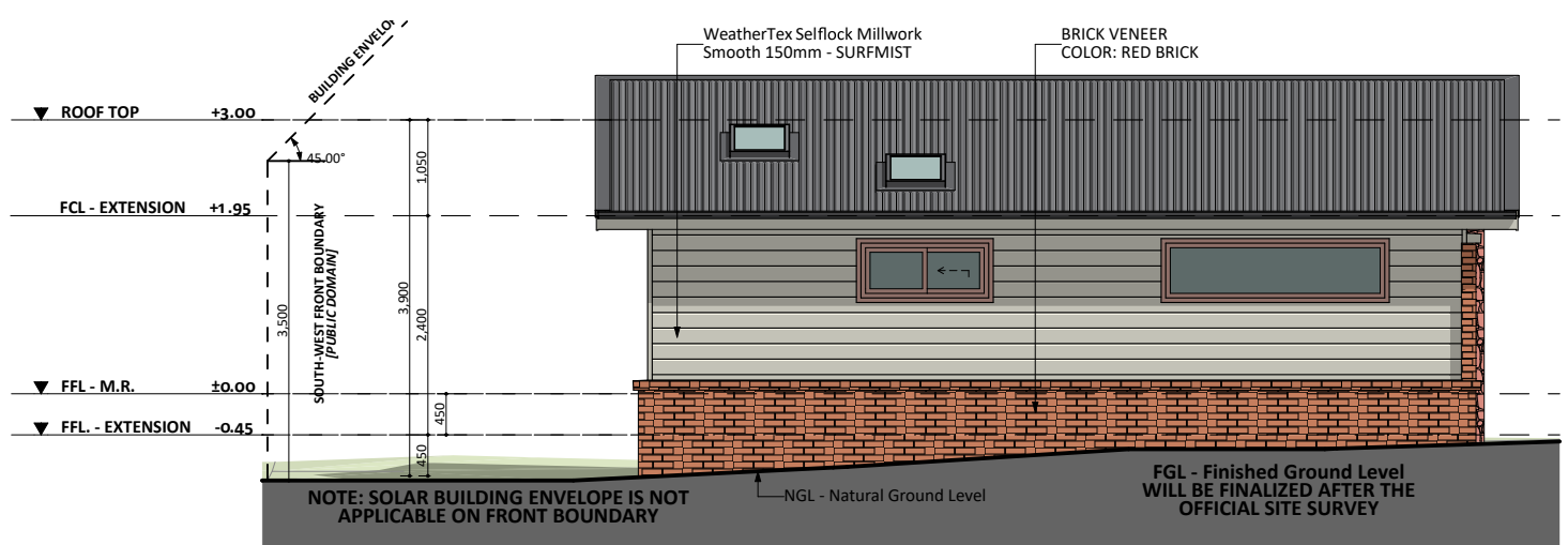
SOUTH-EAST ELEVATION - CD